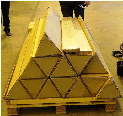
How Distrib XE arrives on-site.